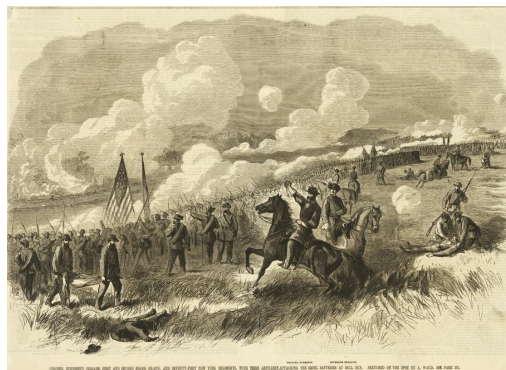
Colonel Burnside Leads the Charge